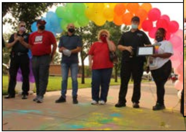
A certificate was presented to McPherson College Essential Workers to thank them for their work during the pandemic as part of the event.